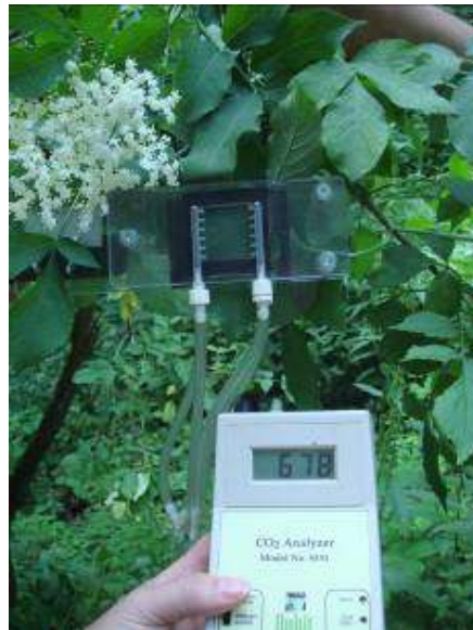
Figure 1. Field CO2 Analysis Package with S151 CO2 analyzer