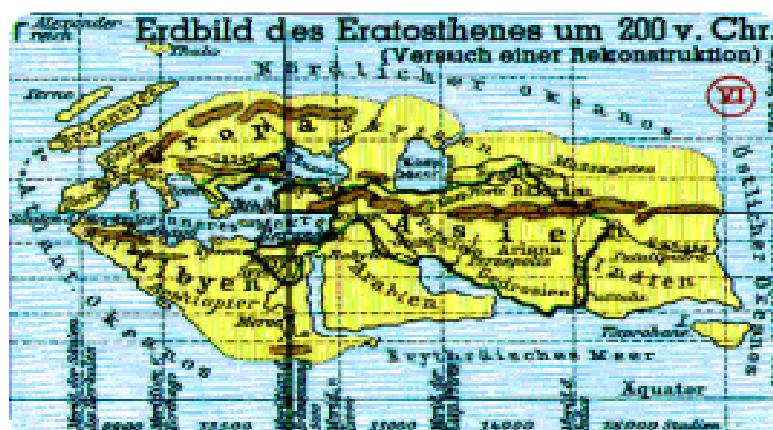
Figure 2. Eratostene World

In Etruscan law wrote: "He who touches or moves a landmark will be judged by the gods, his home will be gone, his people will perish, their lands will not bear fruit, and hail will destroy the heat of harvest, limbs offenders will be covered by sores and will rot"