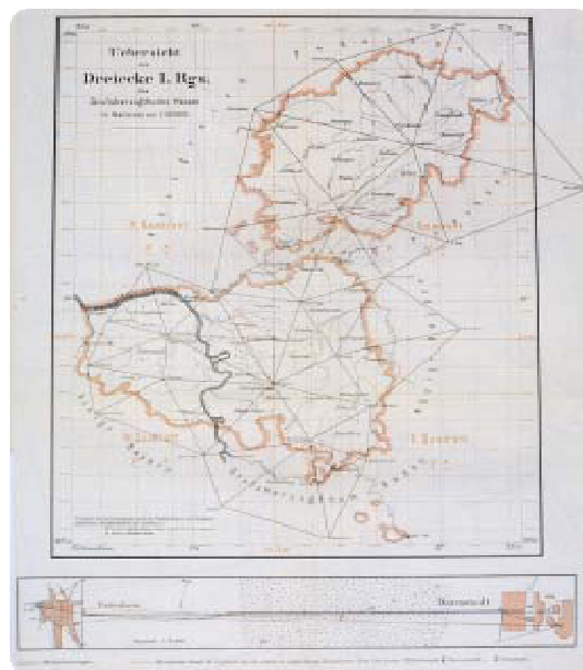
Figure 5. Network map - a -based triangulation Darmstadt-Griesheim

After Delcross they "were determined by a solid wall, which was sunk in the ground. This massive take the form of a prism with a single stone cvadrice area in the center of which there is a copper cylinder, whose center corresponded to the measured end point of the line "