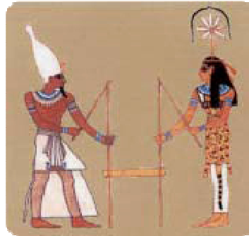
Figure 1. Measurement of basic sections by pharaoh and goddess in temple

formidable construction of streets, bridges and tunnels, as well as the cities, or heat or sewage systems.